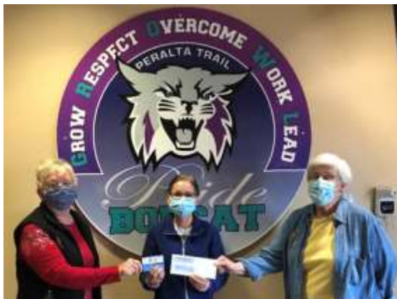
Peralta Trail Elementary

Many thanks to all who donated cash, checks or gift cards for the Angel Tree 2020! Due to your generosity each school has received a check for just over $900. Each school principal was excited to receive this help for their students and their families. You showed the true spirit of Christmas by supporting our Angel tree.