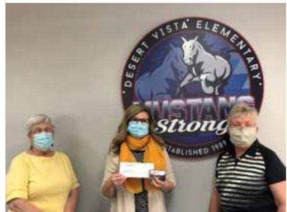
Desert Vista Elementary